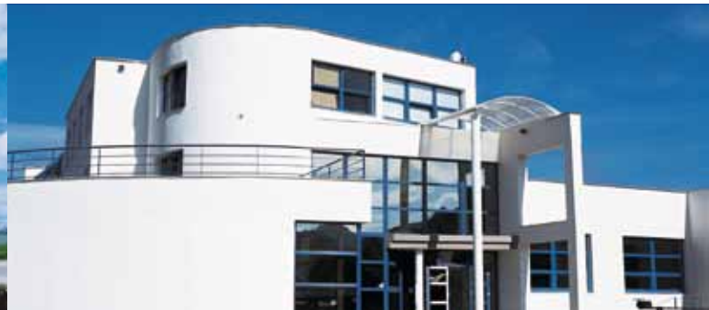
Always a technical step ahead: LEONI Electrical Appliance Assemblies facilities (from left) in China (Changzhou) and in Slovakia.

Proximity to our customers is a core element of our corporate policy. LEONI is a dependable partner to its customers – all over the world. We also regard maintaining, as well as raising, quality and service at the same high level everywhere in the world as a sign of proximity.